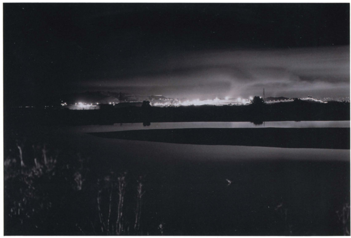
Stephen Tourlentes, San Quentin, CA, 1996, gelatin silver print, 20" x 24"

what they appear to be, for people marked as felons are locked up in those places suffused with unearthly brilliance, where life can be extinguished with the flip of a switch. What lies outside those zones is comparatively innocent and thus clearly not evil. The meanings we traditionally associate with Caravaggesque tenebrism are thereby distorted. In Tourlentes' photographs, light is a mechanism of surveillance and control, generating an atmosphere of fear and threat.