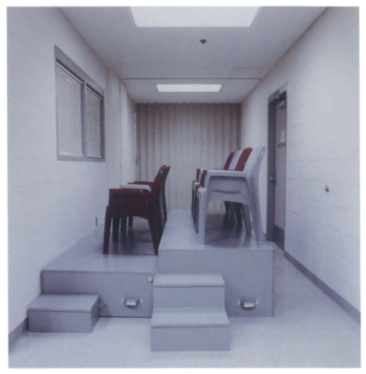
Lucinda Devlin, Witness Room, Potosi Correctional Center, Potosi, Missouri , 1991, c-print, 20" x 20", courtesy Paul Rodgers/9W, NY

world of sleek, authoritarian, modernist interior design. She lets us discover, however, the imperfections embedded in these tightly controlled spatial situations, resembling laboratories, operating rooms and waiting rooms in hospitals. Tacky linoleum floors, cinder-block walls, buckling ceilings of composite board, peeling coats of paint and water stains strike jarring notes in these otherwise immaculate chambers.