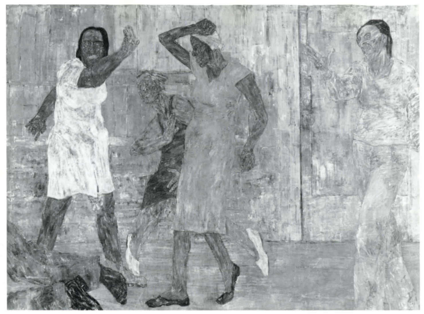
Threnody, acrylic on canvas, 1986, 120" x 167", Collection of The Eli Broad Family Foundation, Santa Monica, Calif.