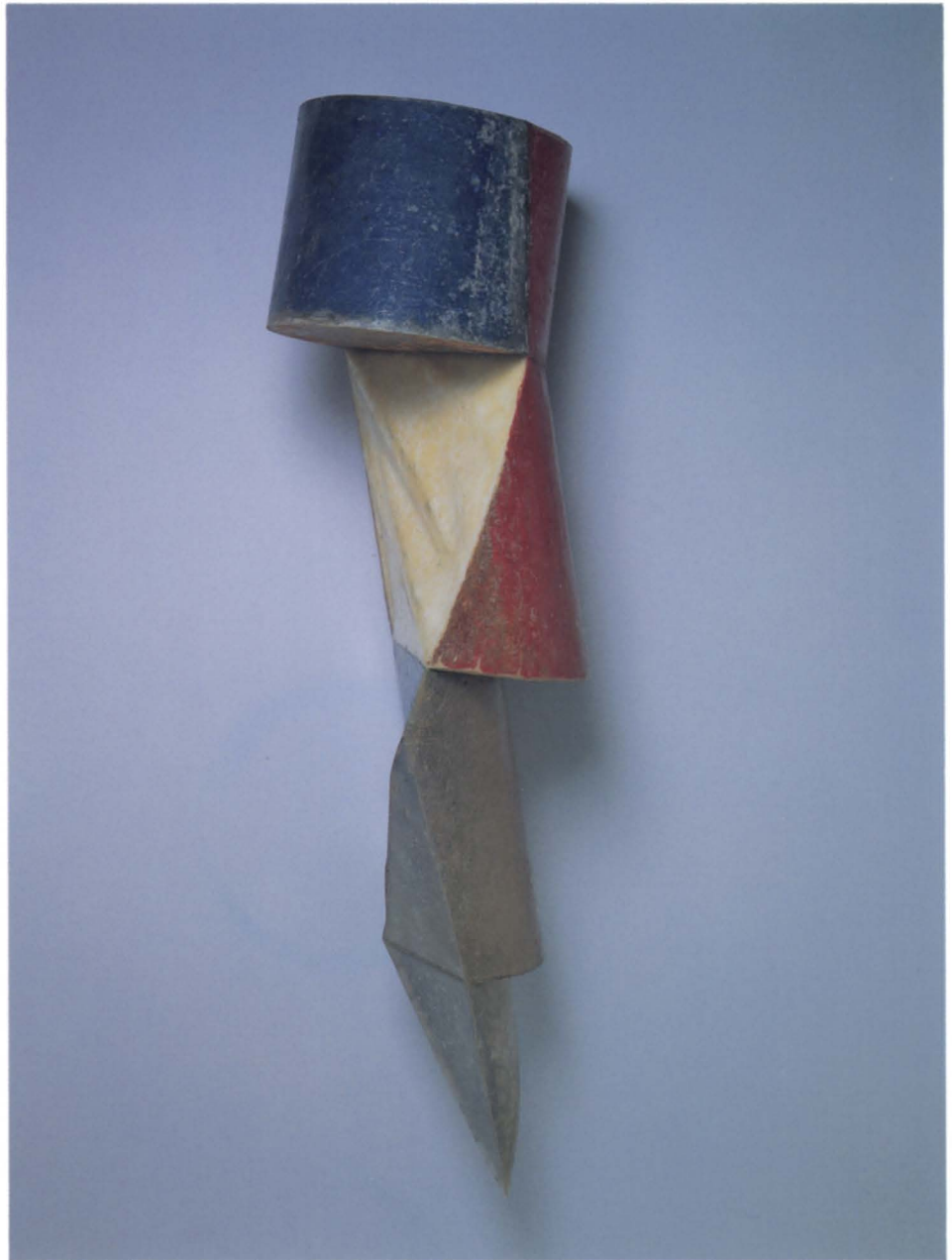
Red Queen , 1985, fiberglass, enamel paint, 87¾" x 22" x 32⅝", collection Walker Art Center, Minneapolis; T.B. Walker Acquisition Fund, 1986.

Even though they are fashioned from industrial materials like fiberglass, steel rods and enamel paint, Duff's sculptures do not have the sleek, impersonal, manufactured aura of minimalist objects. Duff's sculptures clearly have been hand-made and frankly acknowledge