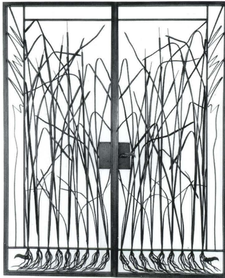
Doors , Gary S. Griffin, 1989, steel, 81" x 66" x 2 1/2", Courtesy of the artist