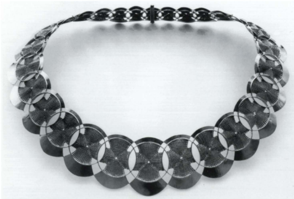
Choker #78 , Mary Lee Hu, 1991, 18-karat and 22-karat gold, 1 1/2" x 8 7/8" x 6 3/8", Courtesy The Merrin Gallery, New York City

can become fully realized, exposing a part of my inner mystery and spirit. I am an assimilator. I borrow and change and learn from past civilizations. I draw from the intimacy of Persian miniatures and the complexity of their rugs, the power and magic of African assemblage sculpture, the delicacy of a Schwitters collage or cast-offs of a Cornell construction, and the unnerving achievements in gold and silver from countless past cultures. This is my heritage, and I build on it. I want to give the viewer so much to see that he becomes trapped by his fascination with the object. The more you look, the more you see; the more you see, the greater the desire to penetrate further the trapped mysteries of the piece – a labyrinth, a great complexity."