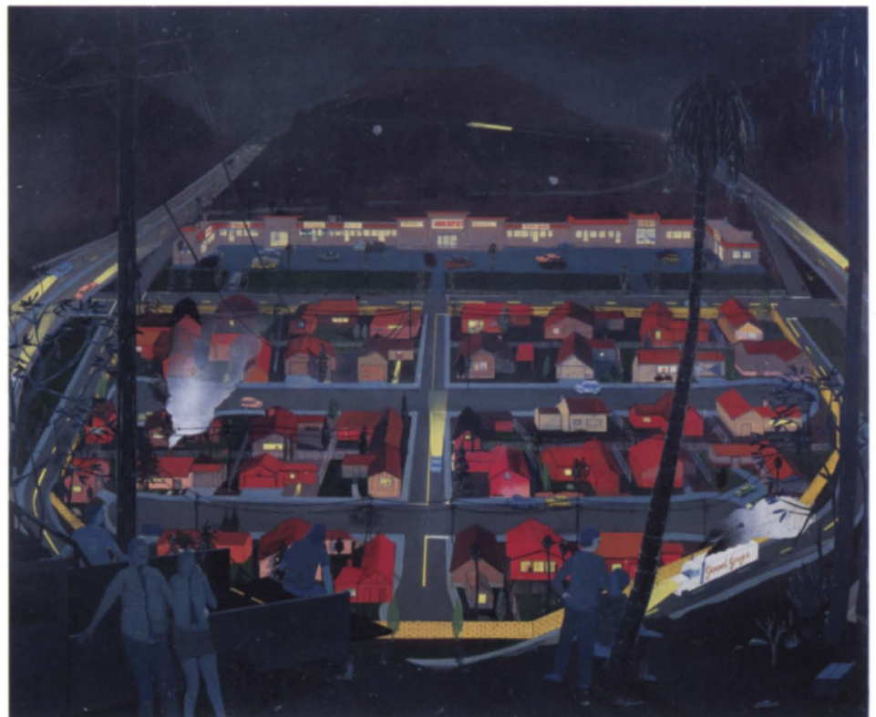
Jules de Balincourt, Temporary Drop Out , 2003, oil, spray paint and pen on board, 40" x 48", courtesy LFL Gallery, NY, collection Johnson County Community College

suits grab farm animals. What is going on here? De Balincourt paints in a naïf style, using highly saturated colors, flat textures, stiff lines, no modeling, and reveling in spatial recession as if he had just stumbled upon it. All of these elements give his