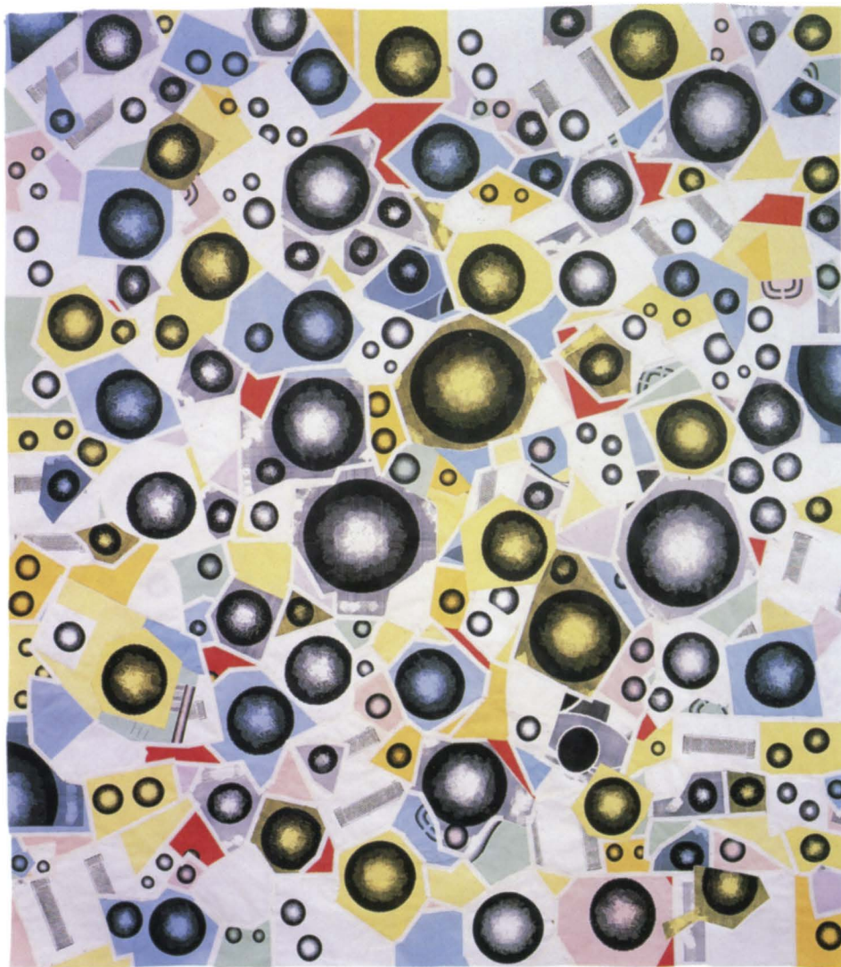
Tom Moody, Greater , 1997, photocopies, linen tape, 88" x 78", courtesy Derek Eller Gallery, New York

two edges or widths or lengths exhibit a shred of mechanical reproduction." Like a Celtic monk laboring over an illuminated manuscript, Siena inscribes endless networks that radiate and pulsate, revealing their intricate geometries over time, verging on but stopping just short of representation. The dizzyingly intertwined zigzags defining Untitled Yellow-Black both relate to, and provide counterpoint to, an inner and outer landscape that has been turned inside out through recent feats of electronic (exact digital reproducibility) and biological (cloning perfect copies) osmosis.