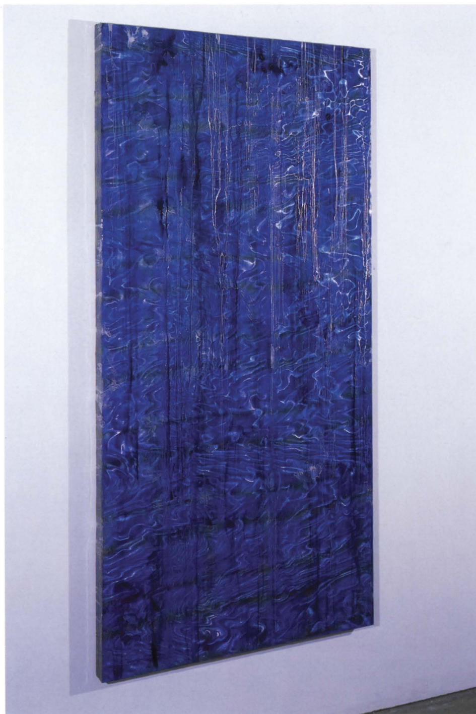
Peter Hopkins, Capital Project: (Covered Site: KC #1) , 1999, fluids and fabric on holographic foils with resin, 72" x 36" x 3"

world gets, circular forms remain insistent reminders of the passage of time, whether they be wheels tracking the road, videotape winding around two spools, age rings on the cross-sections of timber or cellular replication through mitosis.